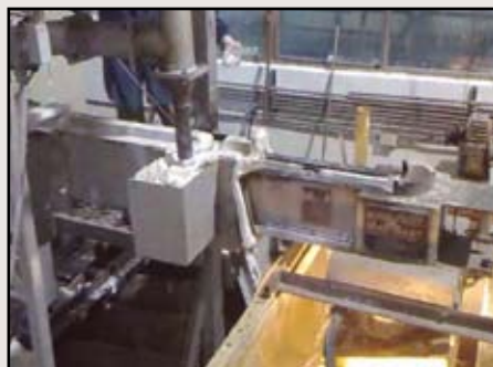
Casting with the T-18T