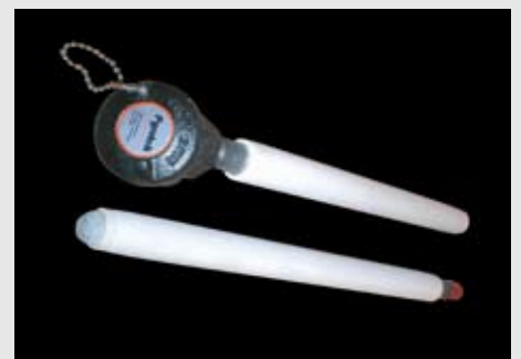
RFM Thermocouple Protection Tube